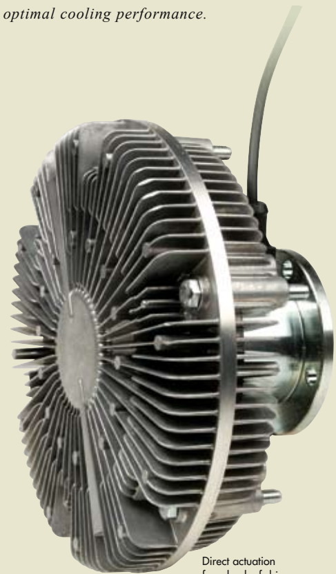
Direct actuation from back of drive

Vistronic fan drives provide intelligent airflow management for optimal cooling performance.